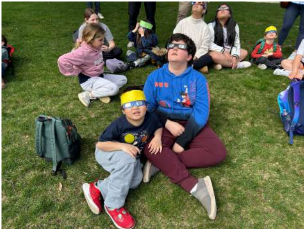
Sixth Graders enjoy April 8th's solar eclipse with Pre-K buddies.

In writing, students have wrapped up their argumentative essays in which they staked out a side in the very real debate about whether or not zoos are good for the animals they keep. By conducting research, drawing on their own experiences, and strategically using compelling language, they worked hard to persuade their readers. After reading them all, it's hard to choose a side!